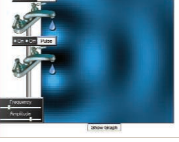
"Wave Interference" simulation. The student can investigate water waves (inset), sound waves (panel shown), and light waves.

Many factors of simulations contribute to this contrast. Identifying these factors is important for effective